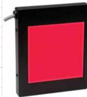
HB Red LED Backlight from Advanced Illumination

Highly uniform backlights are required for inspection of transparent objects (e.g. bottles, LCD glass, etc) to detect imperfections or cracks. Luminit's symmetrical diffusers are currently in use in such applications to homogenize the backlight (either edge-lit or direct back-lit), resulting in more repeatable and accurate dimensional measurement of the part under inspection. Circular diffusers are available in any size up to 60" diagonal.