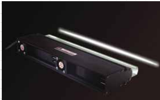
HB White LED Lightline from Advanced Illumination